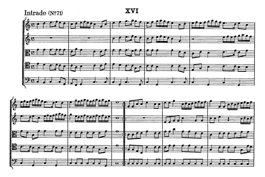
J. Pezel. "Fünf-stimmigte blasende Music". Intrade № 71