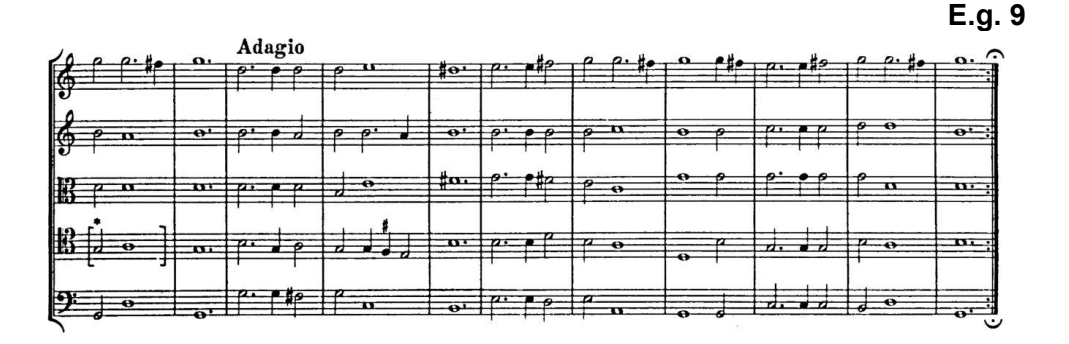
J. Pezel, "Hora decima". Sonata № 13

"Fünf-stimmigte blasende Music" ("Five-part Wind Music", 1685) is a corpus of 76 pieces for an ensemble of brass instruments written in different genres, including dance miniatures (Allemande, Courente, Bal, Sarabande, Gigue) took an important place in the non-dancing Intrade.