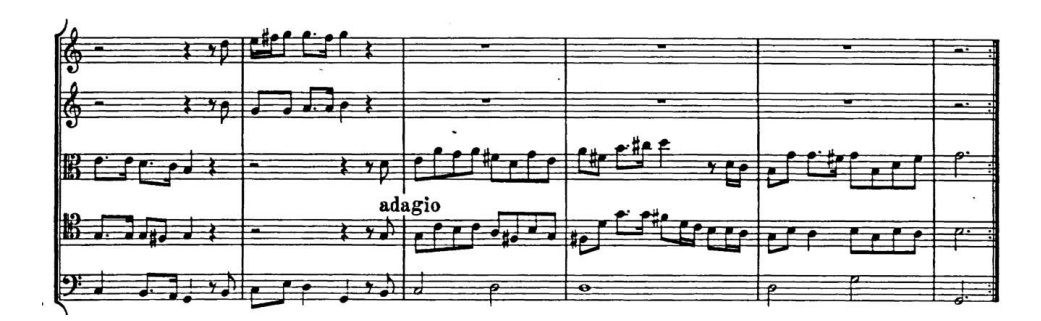
J. Pezel. "Fünf-stimmigte blasende Music". Intrade № 35

In Intrade № 59 C major combines homophonic and polyphonic texture, the united voices contain elements of contrast and imitation polyphony. The finale of Intrade № 71 C major features a two-tone canon of cornets with a brilliant, fanfarely baroque theme, accompanied by a duet of alto and tenor trombones against the backdrop of a simple and clearly constructed functional-harmonic bass trombone line.