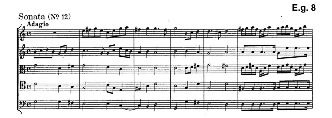
J. Pezel. "Hora decima". Sonata № 12

Functional distribution of parties in sonatas for brass instruments by J. Pezel is mostly stable and completely in line with the traditions of ensemble instrumental performance of the time. All five instruments, regardless of the intonational, rhythmic and tessitric complexity of the material, are involved in the construction of the imitation-polyphonic texture. The bass trombone party in Movement II of Sonata Nº 4 F major, which has octave jumps of eight, in Sonata Nº 6 A minor, where the jump for an increased octave of F - F sharp, as well as in Sonata Nº12 G major and Nº 13 G major, containing complex intonation constructions of sixteen durations, is indicative.