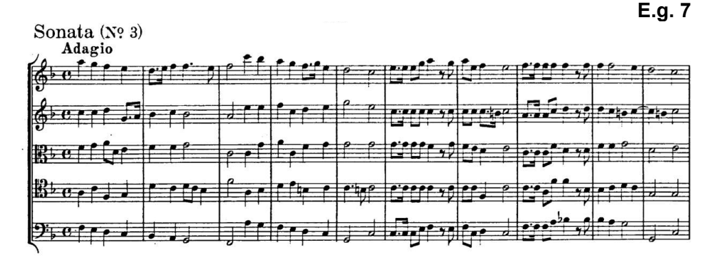
J. Pezel. "Hora decima". Sonata № 3

The composer's skill and ingenuity allow J. Pezel to organize the presentation of the thematic material in such a way as to combine the chord texture naturally and logically with the polyphonic techniques of working with the theme. For example, in the one-piece Sonata № 3 F major melody line of the upper voice in the initial three-stroke accompanies the bass-like downward movement of the bass part in the octave range, which further moves into the first cornet part and forms imitations. In the future, this topic varies widely, and its rhythmically transformed version gains imitative-polyphonic development.