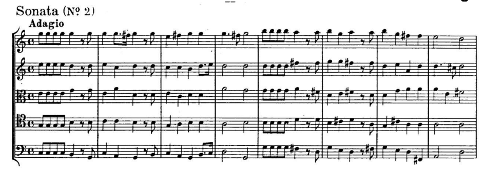
J. Pezel. "Hora decima". Sonata № 2. Movement I

In the future, the rigorous chord sound is inferior to the more advanced imitation-polyphonic presentation, with the appearance of new thematic material whose intonation-rhythmic contour is characterized by greater liveliness, sophistication, and a certain technical complexity for all members of the ensemble.