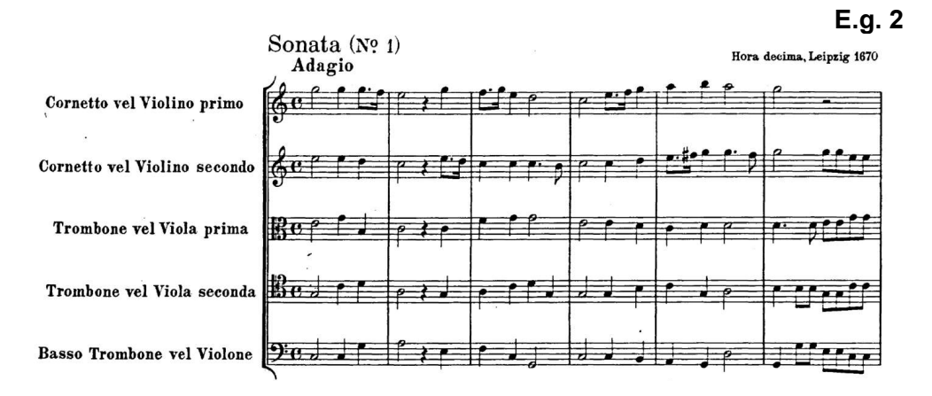
J. Pezel. "Hora decima". Sonata № 1. Movement I

Their parties are built on a smooth, gradual movement within the second octave and are more individualized than monorhythmic trombone parties containing the tone of the chord texture<sup>19</sup>.