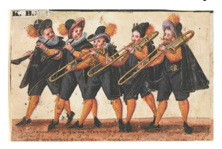
"Wedding Procession" (Germany, about 1590)