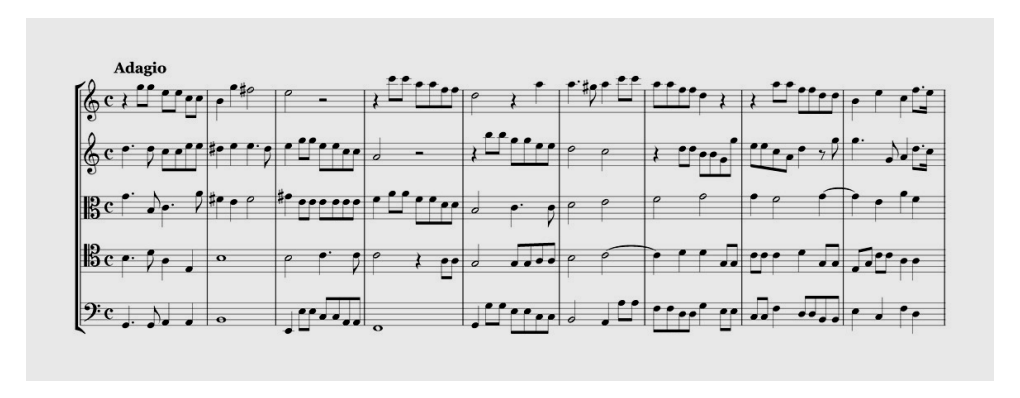
J. Pezel. "Hora decima". Sonata № 1. Movement I