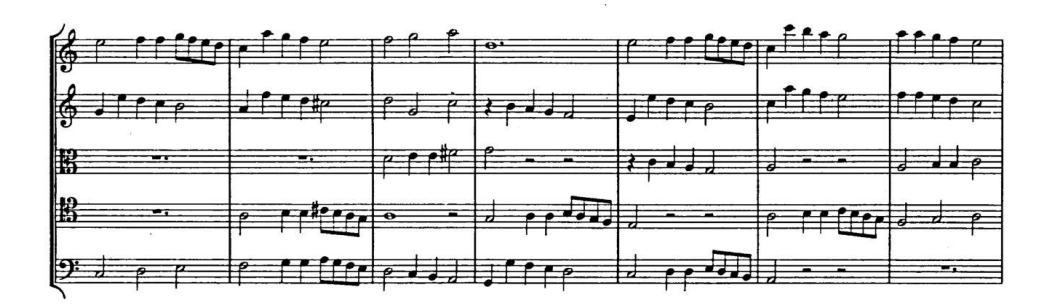
J. Pezel. "Hora decima". Sonata № 2. Movement II

The composer's skill and ingenuity allow J. Pezel to organize the presentation of the thematic material in such a way as to combine the chord texture naturally and logically with the polyphonic techniques of working with the theme. For example, in the one-piece Sonata № 3 F major melody line of the upper voice in the initial three-stroke accompanies the bass-like downward movement of the bass part in the octave range, which further moves into the first cornet part and forms imitations. In the future, this topic varies widely, and its rhythmically transformed version gains imitative-polyphonic development.